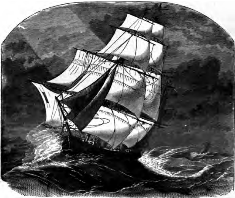
"A wet sheet and a flowing sea." Page 144.